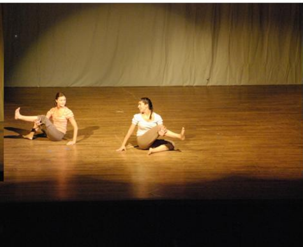
Cor Ignis Company members in photos from Minnesota Performance of Para Ti Mujer in June 2008