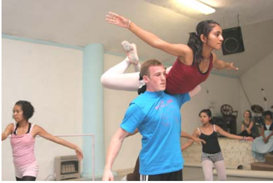
Directed the 4 th Annual Summer Dance Intensive & Mission Outreach at Emmanuel Ballet Academy